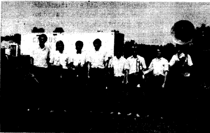
THE 1973 CIRCUS KIRK BRASS BAND. PRESENTING THE FINEST IN TRADITIONAL CIRCUS MUSIC.