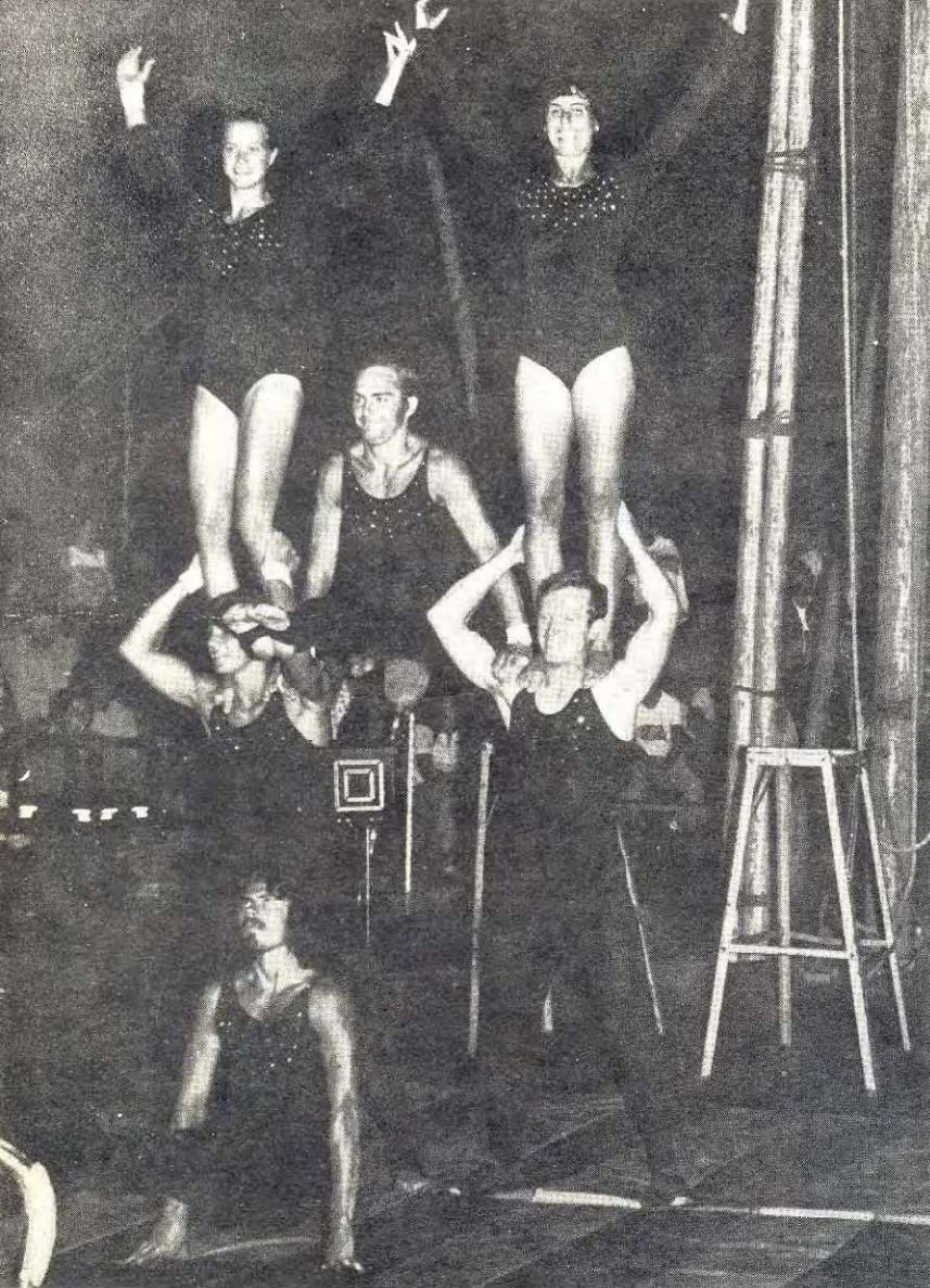
The Circus Kirk gymnastics team