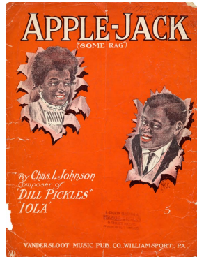
Cover of the piano edition